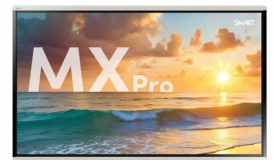
SMART Board® MX Pro series Where productivity and collaboration meet