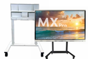
SMART Mobile Stands Add flexibility and mobility