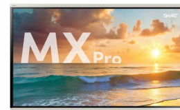
SMART Board® MX Pro series Where productivity and collaboration meet