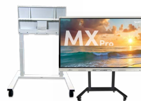
SMART Mobile Stands Add flexibility and mobility