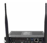
SMART OPS PC Module The power of Windows® 11 Pro—no laptop needed