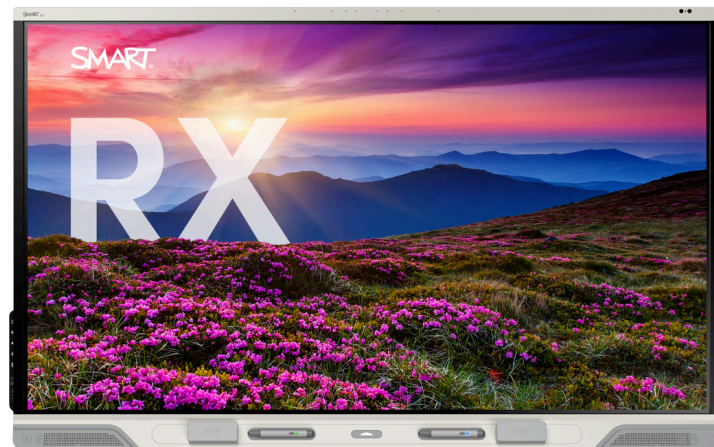
SMART Board® RX series

From customizable stamps to digital manipulatives to instructional audio and much more, SMART's Inclusive Classroom Bundle allows students to engage and participate in all learning experiences with relying on spoken or written language.