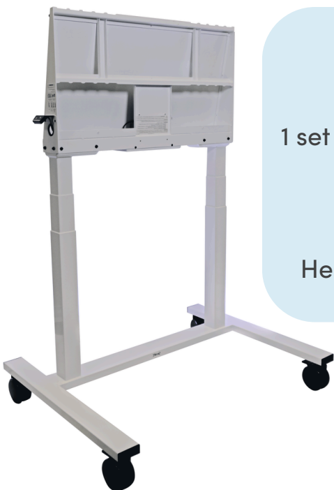
SMART FSE-500 height adjustable mobile stand

Height adjustable stand (optional upgrade)