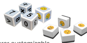
Tool Explorer customizable stamps and cubes